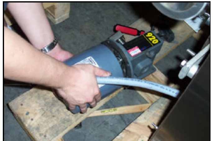
Mounting the motor to the gear reducer.

27. As you have both the drive motor and the gear reducer off of the machine, it is much simpler to assemble them together prior to mounting them. Ensuring that the key for the drive shaft of the drive motor is in the keyway.